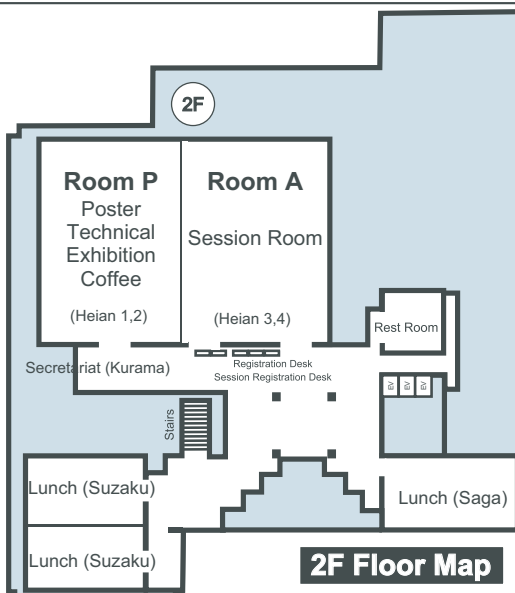
2F Floor Map